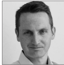
Joe Brock Special Correspondent, Reuters